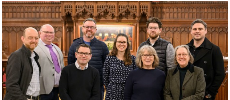
The project team

The project was made possible thanks to the generosity of many members of our HMC community. The work, which was completed in mid-February, was managed